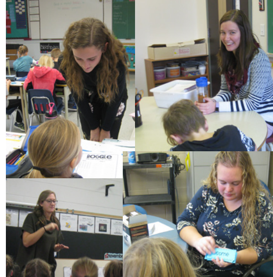
PLEASE NOTE: All photos in this issue are used with permission.

teachers' understand the complexity of a classroom setting where all students are called to use their God-given gifts to the very best of their ability. This includes the most vulnerable members of a school community. It is amazing and beautiful to see how schools have matured in their practice of inclusion. Without fail, our teacher candidates return from a resource room placement with a renewed sense of awe in what it means to educate God's children together. Let us never take this privilege for granted!