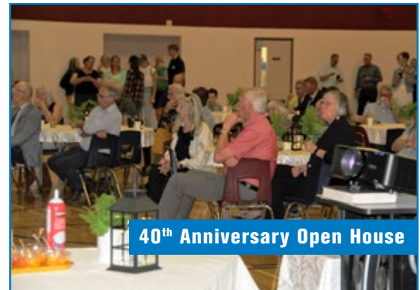
40 th Anniversary Open House

In the year of our LORD, 2022, the College continues striving to be the definitive source for Reformed teacher training. Today, after 40 exciting years, we celebrate God's goodness shown to CCRTC. His faithfulness provides us with "strength for today and bright hope for tomorrow" as we continue to tell the next generation.