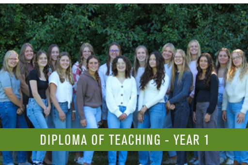
DIPLOMA OF TEACHING - YEAR 1