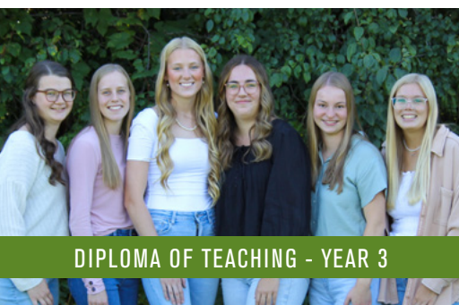
DIPLOMA OF TEACHING - YEAR 3

Some early morning fog, along with the gradually changing colours on the trees, mixed with some nervous-but-good excitement about upcoming practicum placements