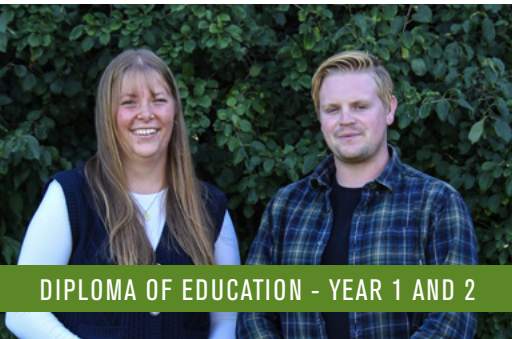
DIPLOMA OF EDUCATION - YEAR 1 AND 2