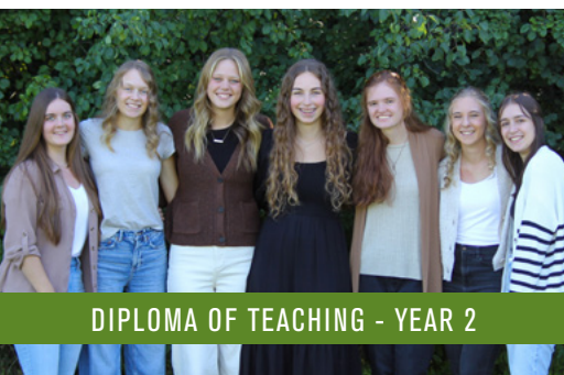
DIPLOMA OF TEACHING - YEAR 2