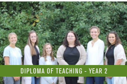
DIPLOMA OF TEACHING - YEAR 2