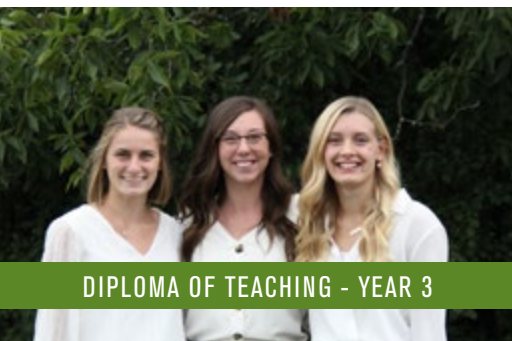
DIPLOMA OF TEACHING - YEAR 3

One of the extra-special moments of any given day at Covenant Canadian Reformed Teachers College (CCRTC) is when students, staff, and faculty are together in the library, eager and ready to begin a new day of learning and teaching. Opening devotions are characterized by the reading from God's Word, singing praises to his great Name, and bringing our adoration, joys, and requests before his throne. The first day of the 2022-2023 academic year formed no exception. Together we considered the words of Psalm 145 as they apply to the education of God's covenant children. It is a text that brings home the importance of training future teachers to be faithful in their calling of telling the next generation of God's work and Word. We paid attention to the beautiful task of teaching as speaking of, meditating on, celebrating, and telling of God's awesome works. And we saw the comfort in doing so while seeking the blessings of our God who is faithful, loving, and righteous and who upholds, lifts up, listens, and watches. It was a privilege to begin the new year in this way and it enabled returning and new students, staff, and faculty members to focus on our shared God-given task.