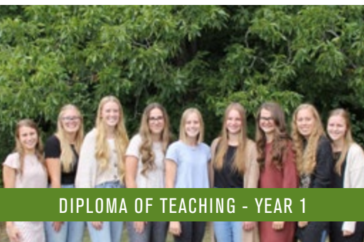
DIPLOMA OF TEACHING - YEAR 1