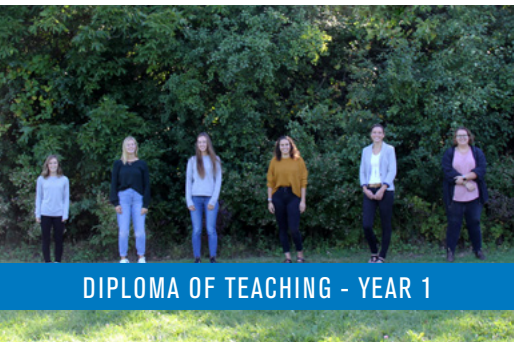
DIPLOMA OF TEACHING - YEAR 1