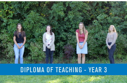
DIPLOMA OF TEACHING - YEAR 3

By the time the Fall Newsletter reaches your hands or screens