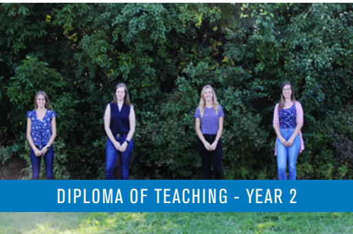
DIPLOMA OF TEACHING - YEAR 2