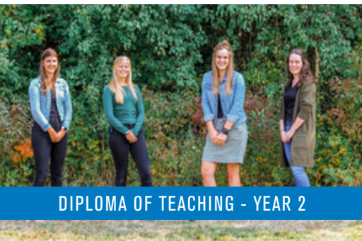
DIPLOMA OF TEACHING - YEAR 2