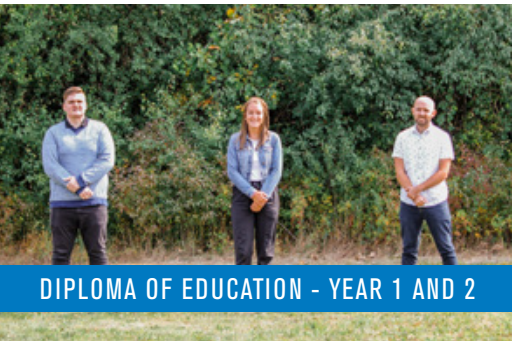
DIPLOMA OF EDUCATION - YEAR 1 AND 2