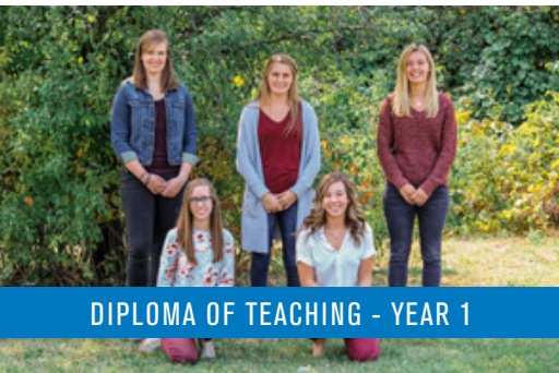
DIPLOMA OF TEACHING - YEAR 1