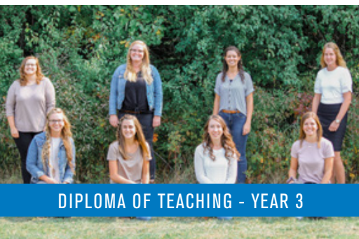
DIPLOMA OF TEACHING - YEAR 3

What a blessing to be able to begin a new academic year in-person! Staff, faculty, students, and the Chairman of the Board gathered at the Cornerstone Canadian Reformed Church in Hamilton in order to begin the 2020-2021 year.