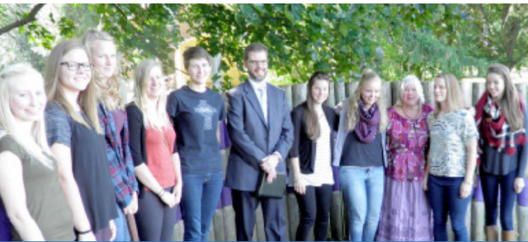
Thank you for your financial commitment, it is very much appreciated!

✂ Please detach and use the postage paid envelope enclosed or mail to: CCRTC • 410 Crerar Drive • Hamilton, ON • L9A 5K3